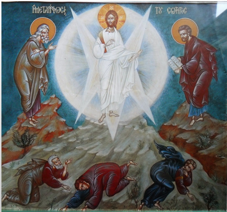
The confession of the Holy Apostle Peter was confirmed by the voice of God the Father.

“Now after six days Jesus took Peter, James, and John his brother, led them up on a high mountain by themselves; and He was transfigured before them. His face shone like the sun, and His clothes became as white as the light. And behold, Moses and Elijah appeared to them, talking with Him. Then Peter answered and said to Jesus, “Lord, it is good for us to be here; if You wish, let us make here three tabernacles: one for You, one for Moses, and one for Elijah.” While he was still speaking, behold, a bright cloud overshadowed them; and suddenly a voice came out of the cloud, saying, “This is My beloved Son, in whom I am well pleased. Hear Him!” And when the disciples heard, they fell on their faces and were greatly afraid. But Jesus came and touched them and said, “Arise, and do not be afraid.” When they had lifted up their eyes, they saw no one but Jesus only.”